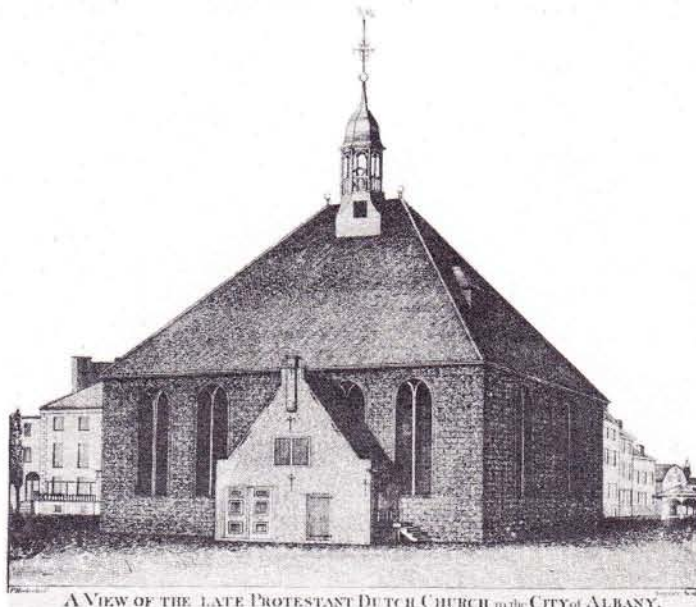
A VIEW OF THE LATE PROTESTANT DUTCH CHURCH in the CITY of ALBANY.